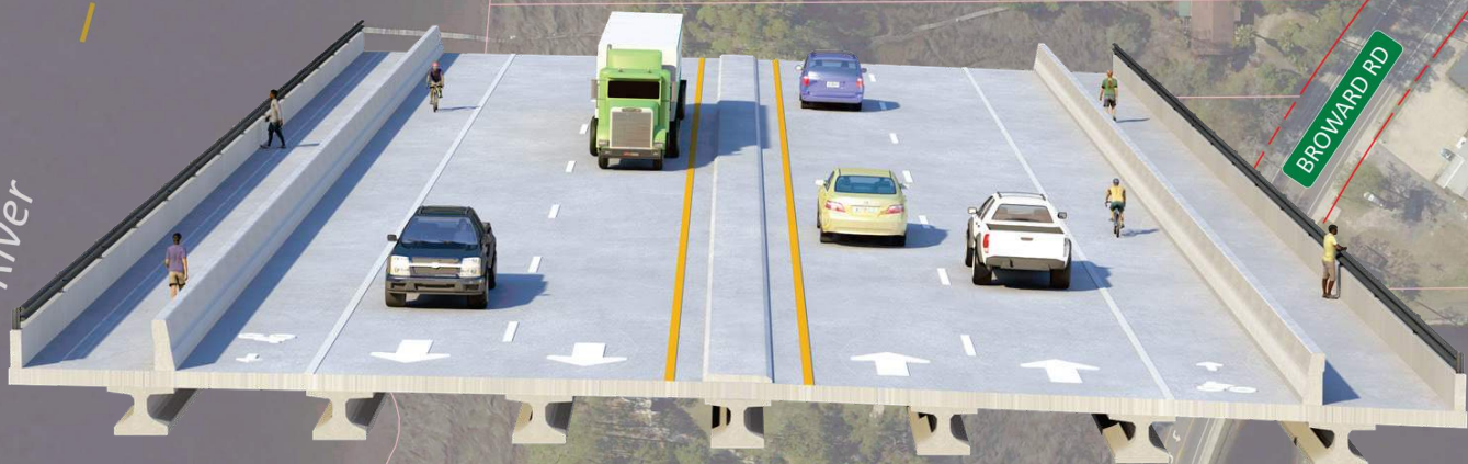
Proposed Bridge Typical Section

NAVIGATION CHANNEL BRIDGE OPENING (40-FT WIDE x 17.9-FT HIGH)